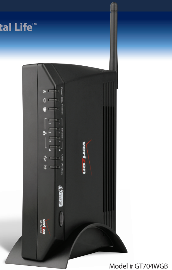
Model # GT704WGB

The Gateway also functions as an Internet firewall, providing the home network with robust protection from outside threats, like hackers or other individuals looking to snoop in personal files. Three different levels of protection allow your customer to customize the level of security. Wireless transmissions are also protected, since the Gateway utilizes 64-, 128-, or 256-bit encryption or WPA2 for ironclad protection.